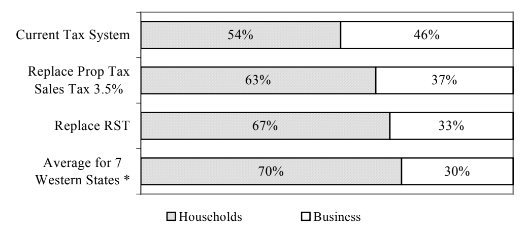
Chart 7-C Flat Rate Personal Income Tax Share of Tax by Households/Businesses